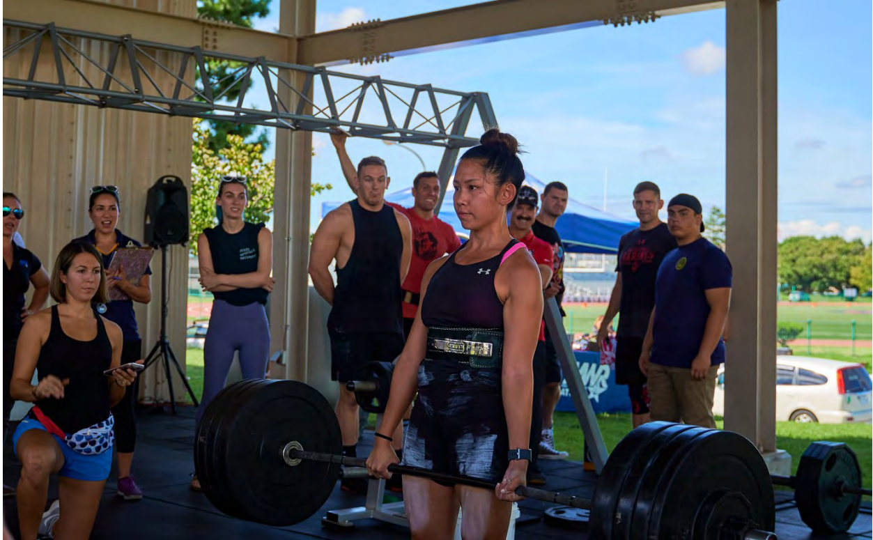
NAF Atsugi Strongman Competition.

training gear, and more. With no memberships and cheap to pay-nothing group fitness classes... what's not to love? Take advantage of these facilities while you're here, and join our Atsugi Fitness Facebook community if you need a little extra motivation.