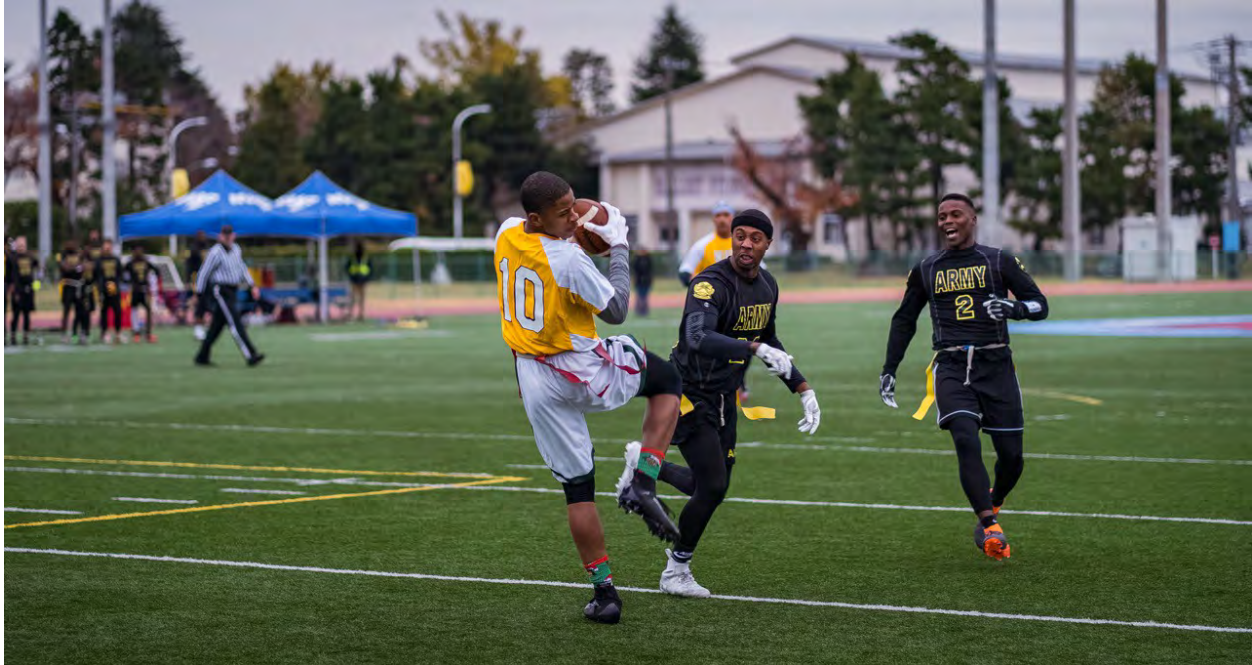
Annual Army-Navy Football Game at NAF Atsugi.