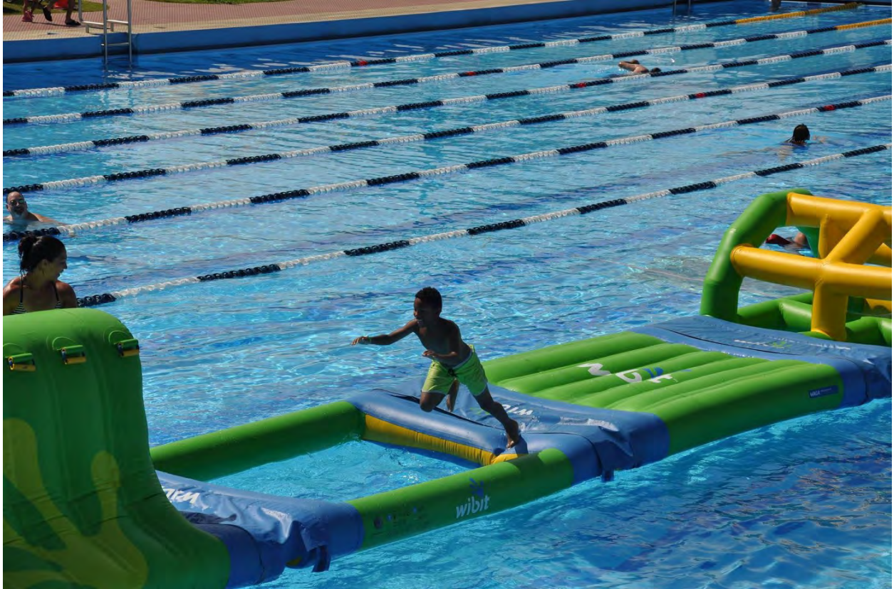
Wibit Day at the Outdoor Pool.